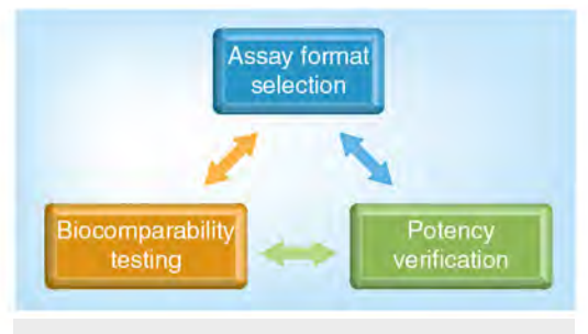
Figure 1. Approaches to method development.

The format and the reagents that will most utilize the epitopes of closest similarity, if not identical, between the innovator and the biosimilar should be selected. This will contribute to the development of a PK assay that has low variability, to enable the detection of potential